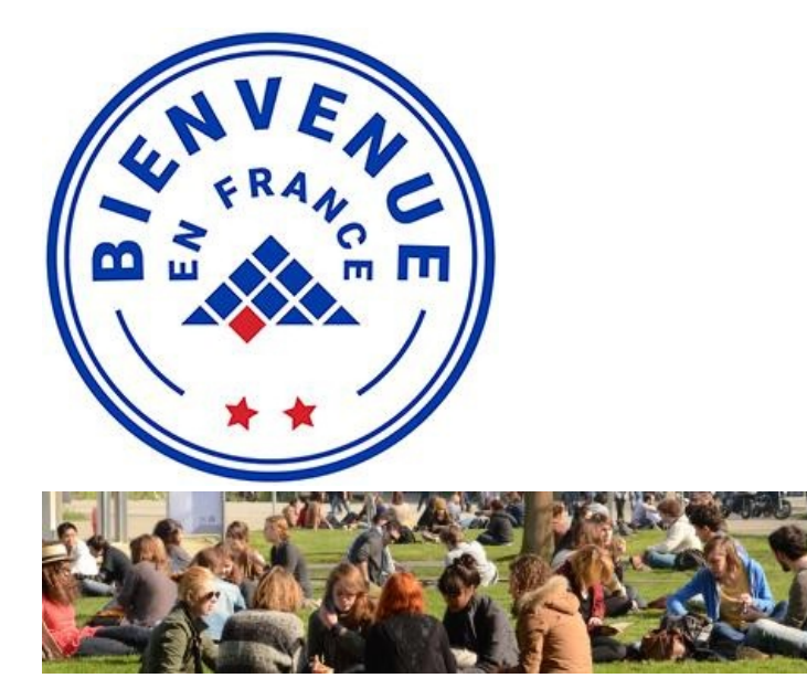
Fichiers associés What is the Bienvenue en France label? Find out more here.