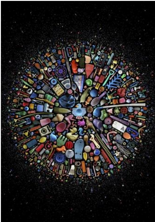
Soup, 500+

The images are intentionally presented in a visually attractive way to draw the viewer in to look at the work, then to shock them with the captions and facts of what is being represented. To make the public aware of the detrimental impacts of marine plastic as both a climate change issue, the effects on biodiversity and ultimately ourselves, I hope this connection with a wider audience will in some way help to inspire change. Photography is a form of communication that has the ability to educate, inform, and increase awareness, if it has the power to encourage people to act, to move them emotionally, or at the very least make them take notice, then this must surely be a vital element to stimulate debate, and ultimately change. If I didn't believe my work did any of these things then I wouldn't be motivated to continue.