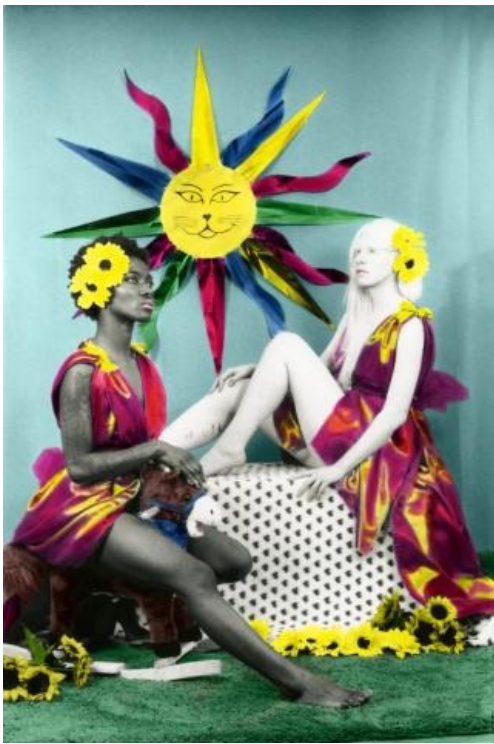
© Zaida González Ríos, Courtesy Galerie NegPos