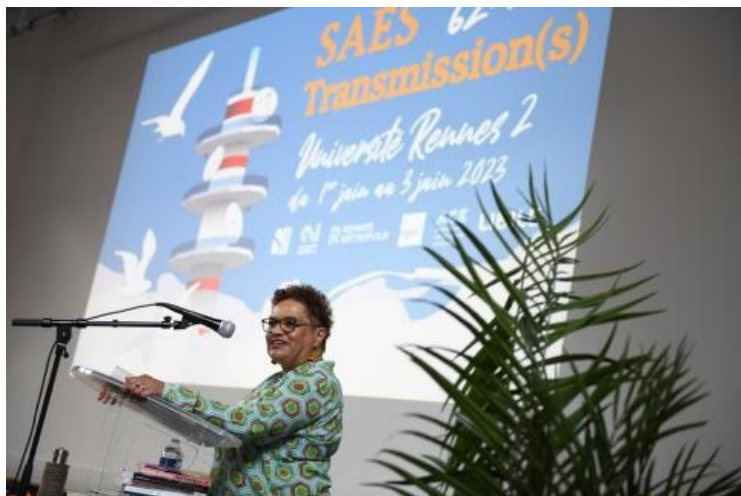
Poet and guest of honor, Jackie Kay

The group also welcomed as guest of honor and keynote speaker , poet Jackie Kay, named "Scotland's National Poet" from 2016 to 2021. Her work describes her experience as an adopted child of mixed race. Her poetry is marked by a variety of voices, in a quest for cultural identity that explores how memory is transmitted. Jackie Kay redefines her genealogy by imagining alternative chains of cultural "transmission(s)".