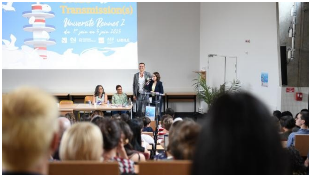
Organizers of the conference with guest of honor, Jackie Kay.

From June 1st-3rd, 2023, over 500 specialists working in various English studies disciplines gathered in Rennes to discuss the theme of "transmission(s)" using a broad range of lenses, including historical, artistic, cultural, literary, political and scientific perspectives. The event included over 30 workshops , 3 roundtables and 4 interdisciplinary panels. The workshops were broken down into sub-themes, to give the richest possible account of the diversity of ways in which "transmission(s)" are made. For example, there were workshops devoted to childhood studies, dealing with "transmission(s)" through illustration, childhood cultural objects, children's novels and so on.