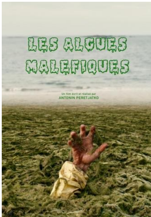
Poster of the film Les Algues maléfiques by Antonin Peretjatko

A scientist in a yellow suit is sampling green algae on a Breton beach. Lifting his mask, he drops dead. Panic in the village: he's not the first to disappear, and the municipality rightly suspects toxic algae. But there's no question of threatening tourism or blaming intensive farming for this evil invasion. The mayor prefers to suspect the Parisian "bobos" who rent Airbnb on the beachfront. But all it takes is one big tide for the disappeared to re-emerge from the seaweed carpet in zombie form. From there, of course, everything goes downhill. A zany film, haunted by ecological issues and populated by zombies, based on genre humor and the absurdity of clichés.