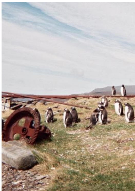
Terra Australis , 2023

Terra Australis, or "Land of the South", is an ancient concept referring to a hypothetical continent located in the southern hemisphere, which would balance out geographically with the lands of the northern hemisphere. Since the dawn of time, it has inspired a mythical imagination that has given rise to numerous explorations, including the discovery of the Kerguelen Islands in 1772.