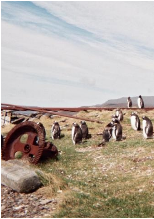
Terra Australis , 2023 © Ella Daly