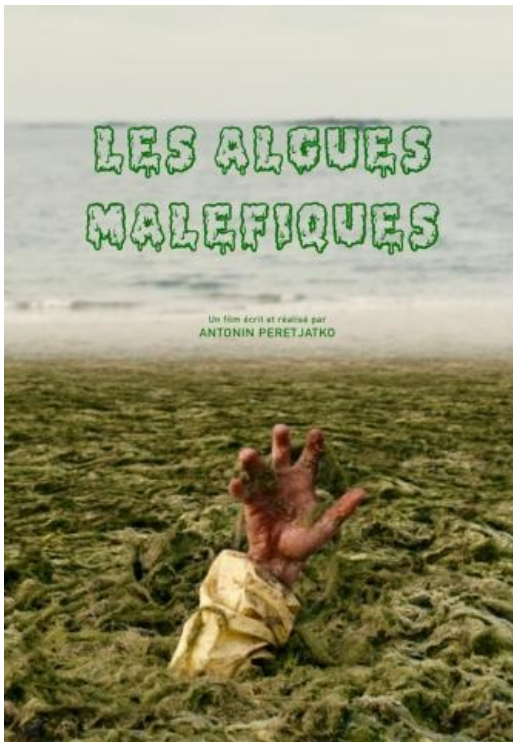
Poster of the film Les Algues maléfiques by Antonin Peretjatko

November 16th, Roundtable with Mandy Barker, creator of the photographic exhibit Plastic sea ( https://culture.service.univ-rennes2.fr/index.php/event/table-ronde-rencontre-avec-mandy-barker )