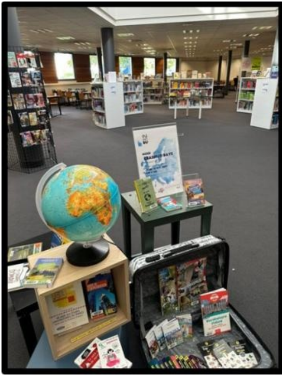
The Espace des Langues