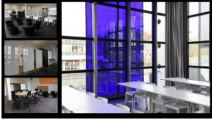
The Third Place