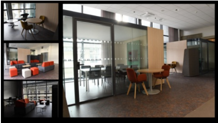
The research area

This new space, created for the Rennes research and doctoral community, complements the online services around open science offered by the University on the SOcle platform and within the Slate Data Workshop. In it, researchers and doctoral students will find all the necessary equipment to carry out their work: posts equipped with software for data acquisition and processing, two bookable meeting rooms that can accommodate up to 8 people, 1 of which is equipped for video conferences and an open conviviality space that can accommodate presentations.