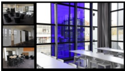
The Third Place