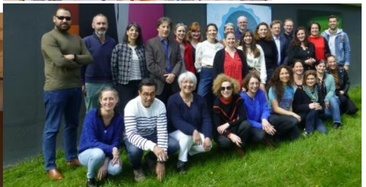
The CIREFE team (spring, 2024)