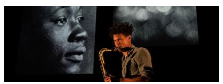
21 February 2025